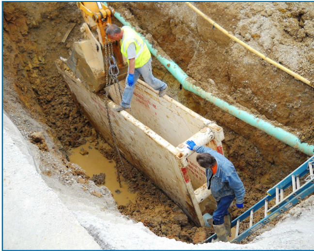
Work in progress on Gallaher Road to extend a section of the sewer line.