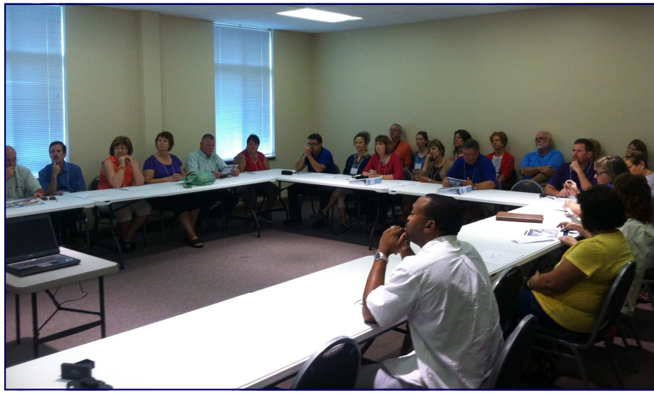
Members of East Tennessee Regional Leadership held the first formal meeting in the Conference Room at the new Kingston City Hall on July 24th.

Please keep these folks and their families in your prayers!