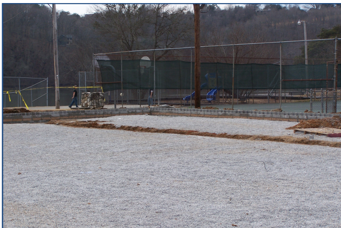
Rock is spread