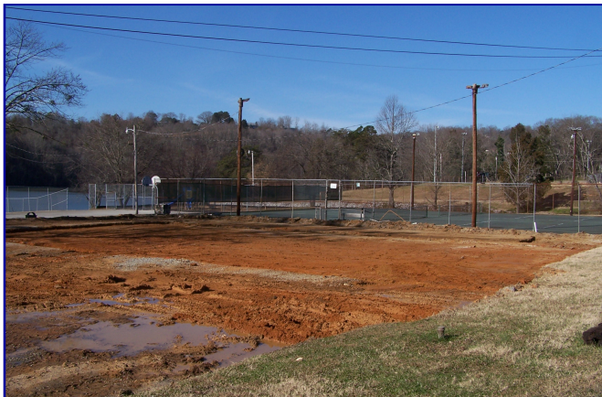
The new site