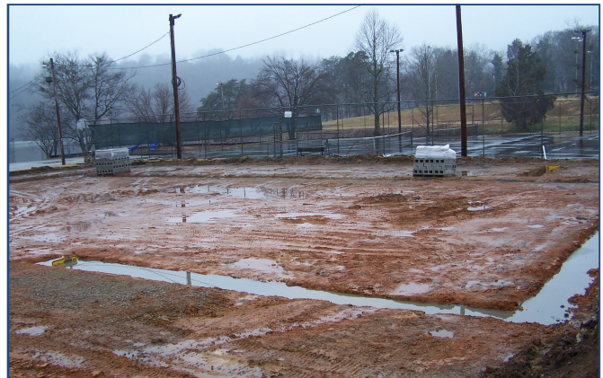
Footers are poured