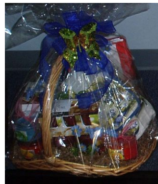
Tea Time Basket