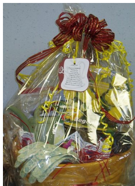
Begonia's in Bloom

Spread the word! City employees are sponsoring and preparing a Spaghetti Supper and Silent Auction for Thursday, February 25 beginning at 5:30 p.m. at the Kingston Community Center to raise funds for the new Pavilion at Kingston City Park. Bid on a variety of gift baskets including an all chocolate basket, a Paula Deen basket, a Reading basket, boys and girls Easter baskets and many other themed choices. For $5 you get a salad, spaghetti, bread, dessert and drink and a chance to bid on these remarkable baskets! Come on down!!!