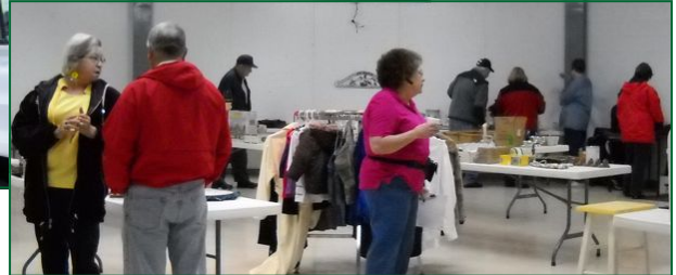
The "Almost New Sale" on March 20th!