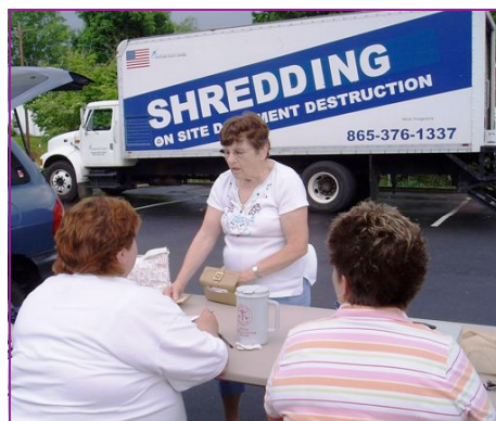
Another Kingston citizen takes advantage of our shred day!