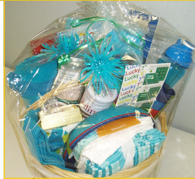
Ladies' Basket Valued at $300