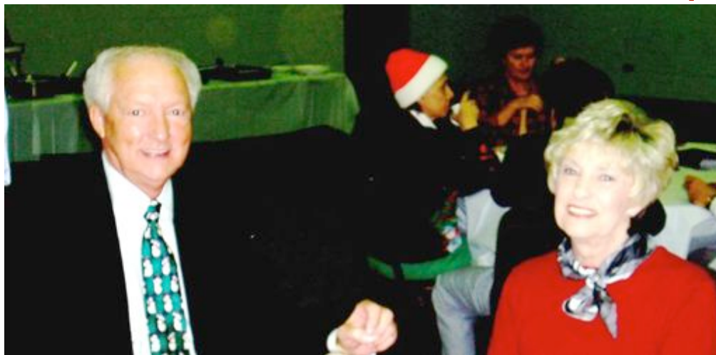
Mayor and First Lady Beets