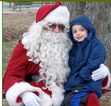
Candy Cane Hunt Visitor