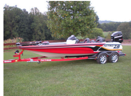
2011 Nitro Z-9

The Bass Angler Invitational Tournament (B.A.I.T.) was held in Kingston on Saturday, February 26 with 21 pounds winning the day. One lucky angler caught a 5-pound small mouth bass. They film their tournaments and gave Kingston great press (i.e., stay at Super 8, eat at Red Bones and Hardees, etc.