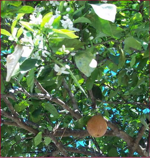
Mills Orange Grove