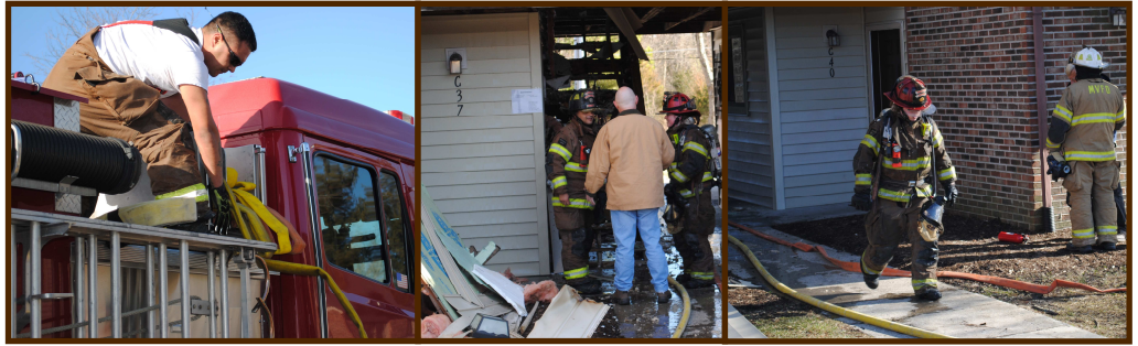
Fire Department employees are getting a workout so far this year responding to local fires. In the pictures above they are working a fire at the Kingston Four apartments in Kingston.