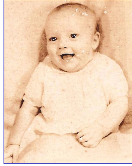
What a happy baby!