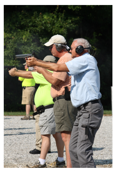
Mayor Beets got in on the action