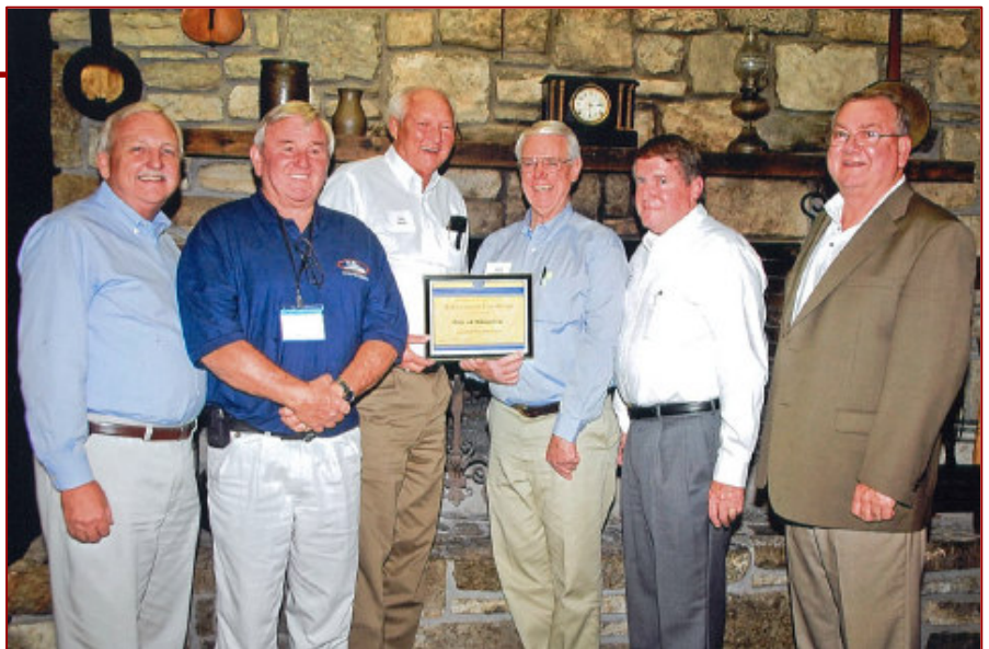
ETDD 2012 Annual Awards Banquet Museum of Appalachia—June 7, 2012

Kingston received an Achievement Award for the completion of the Automated Water Meter Project.