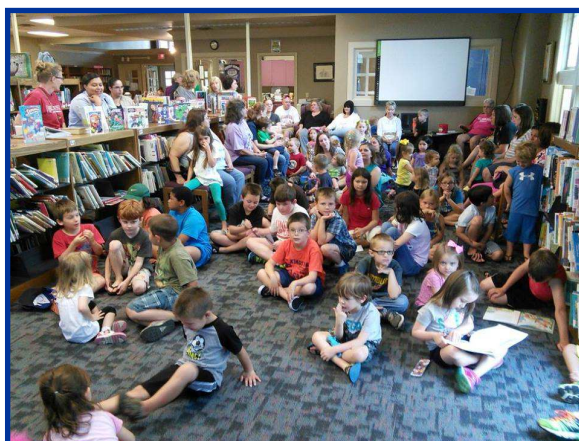
Another successful "children's day" at the Kingston Library!