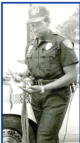
Do you recognize the officer in the picture above?