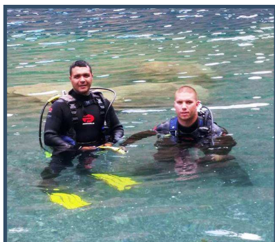
Firefighters working on their diving skills!

City employees, along with Council members and volunteers, collected $4,367.01 during the roadblock on Friday, June 12th for the fireworks to be held in Kingston during the July 4th celebration!