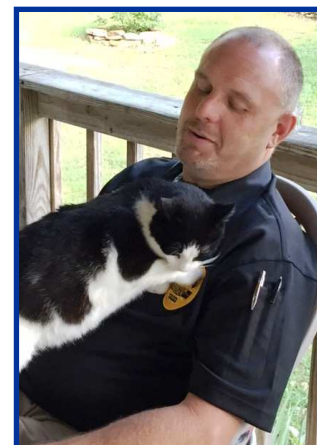
Looks like someone made a friend on this call!