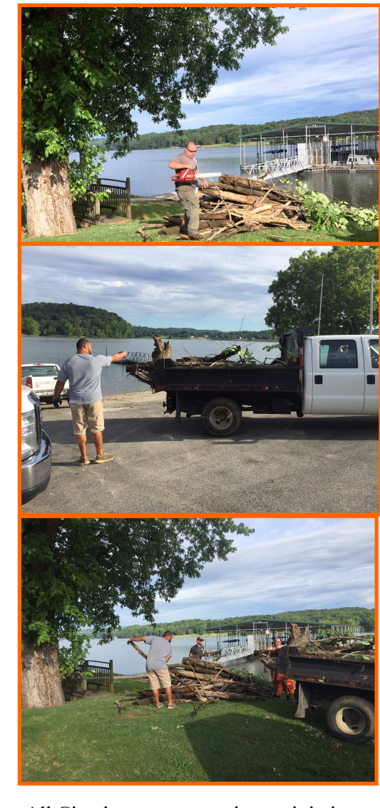
All City department employees join in cleaning up the lakefront for the 2017 Annual Smokin' the Water event

BRING A FRIEND OR NEIGHBOR AND HELP US PLAN FOR THE FUTURE OF OUR WONDERFUL CITY!