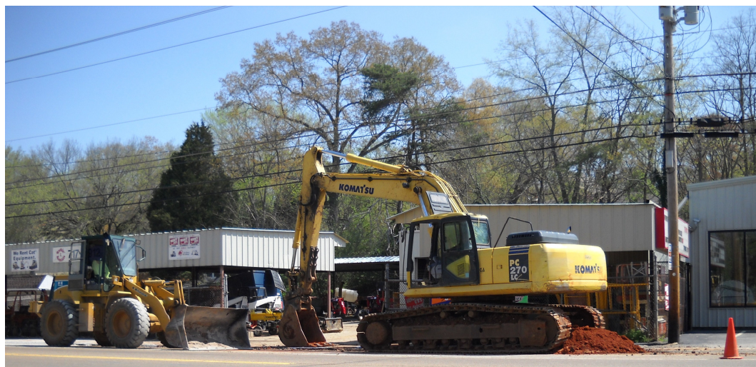
Crews take a break from preparing for the Rockwood Waterline Interconnect Project on Highway 70

Let's hope for an abundance of patience in the next few months (years?) as construction begins in several different areas in Kingston—you might say from one end to the other.