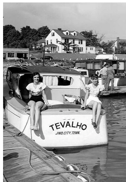
Boat docked at City Park. Year?