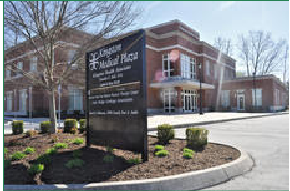
900 Waterford Place in Ladd Landing