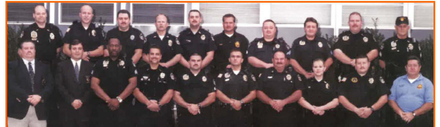
KINGSTON POLICE DEPARTMENT 2003