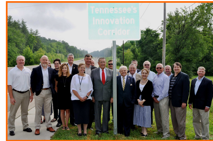
On June 2, 2017, a group of government officials/ representatives from the counties of Anderson, Roane and the cities of Clinton, Kingston, and Oak Ridge met at the Guard Shack as you enter Oak Ridge for a ceremony acknowledging the Tennessee General Assembly's decision to officially designate Highways 58/95/61

between I-40 Exit 356 in Kingston and I-75 Exit 122 in Clinton as Tennessee's Innovation Corridor. The first of nine signs designating this corridor was installed at the Guard Shack.