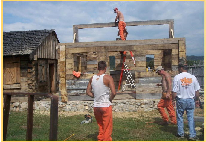
City employees, with assistance from prisoners, continue construction of the Leather Shop at Fort Southwest Point.