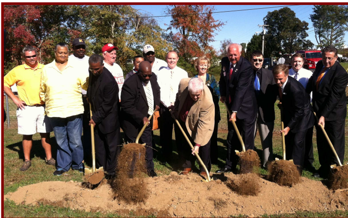
Gov. Bill Haslam visits the Ground Breaking Ceremony at Gertrude Porter Park on October 29th.

The City of Kingston hosted a ground breaking for their second solar farm on October 27, 2014, at 10:00 a.m.. This will be a 200 kW solar farm and will be comprised of 800 solar panels that will collect from the sunlight and convert into electricity—enough to off-set the power needs of the Kingston Water Plant. The system will generate between 4,000/5,000 a month in revenue from TVA which goes into the city and over the course of 20 years the city will see one million dollars in energy savings. It is a great example of a partnership between the public and private sectors.