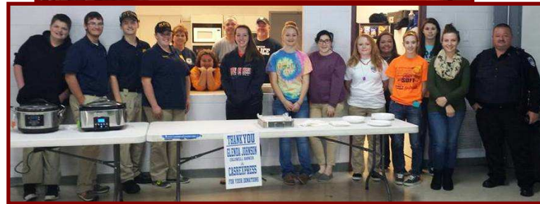
Kingston Police Explorer's Post 376 held a Pancake Breakfast on October 25th to raise funds for their uniforms and projects.