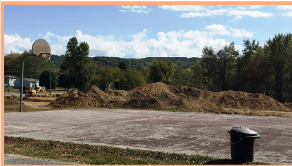
Excavation is underway on the development of Gertrude Porter Park in Kingston.