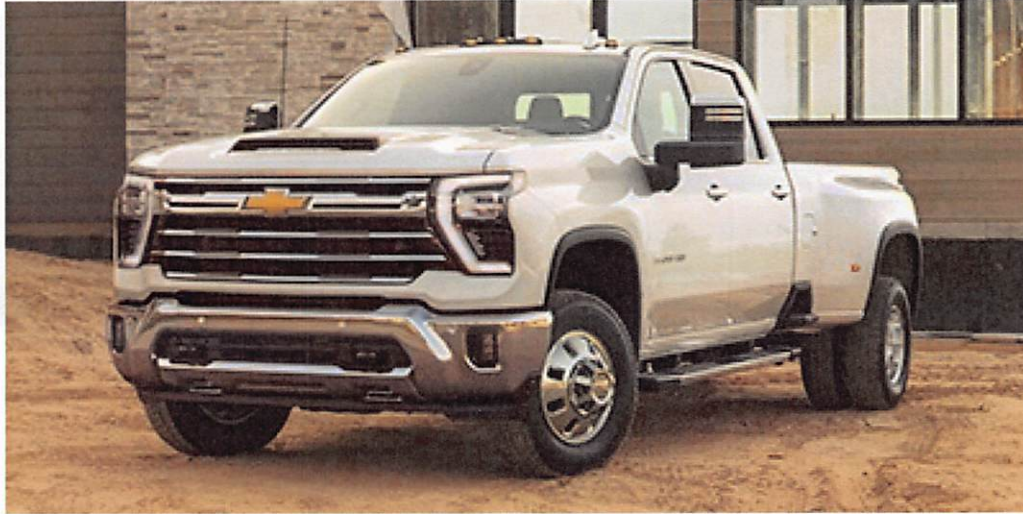
Note:Photo may not represent exact vehicle or selected equipment.

Vehicle: [Fleet] 2024 Chevrolet Silverado 3500HD (CK30743) 4WD Crew Cab 159" Work Truck ( Complete )